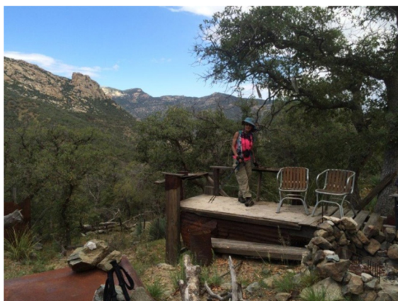
Figure 7: Hikers Rest Area

Summary by T. Johnson from various web sources.