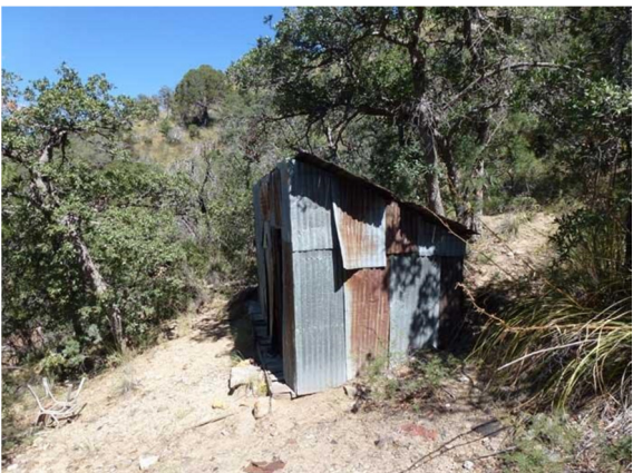
Figure 6: "10 Downing Place" Shed

Catalina Camp can be accessed from the upper slopes of the Catalina Mountains by two different routes. One way is to take the Red Ridge Trail (Trail #2) from the trailhead on the road to Ski Valley and the top of Mount Lemmon down to a trail intersection just west of the camp-. The other route is via the Arizona Trail/Oracle Ridge Trail #1 from the trailhead on the Control Road down to Dan Saddle. From Dan Saddle, take the Catalina Camp Trail #401 to the Camp. If you can stage a vehicle at one of the trailheads, a loop hike is a nice way to visit the camp.