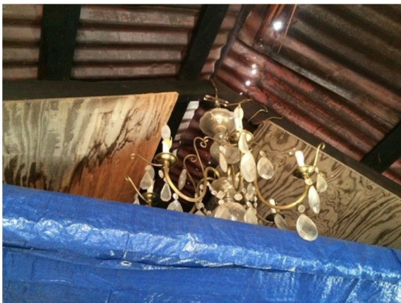
Figure 4: The Famous Chandelier