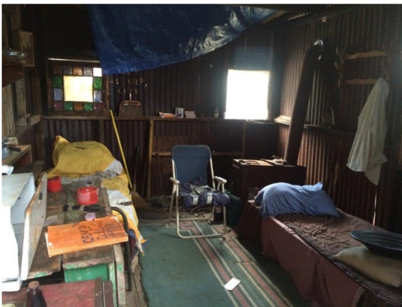
Figure 2: Interior of the Main Cabin