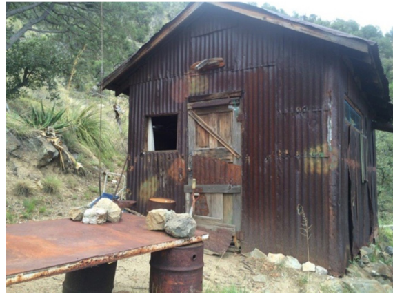
Figure 1: Catalina Camp Main Cabin

The cabin (Figure 1) has a sign over the door identifying it as “One Park Place”. Inside the cabin you will find a chandelier hanging from the ceiling (Figure 4) and two stained glass windows (Figures 2 and 3 depict the windows). You will also find a wood burning stove (Figure 2) to keep you warm in the winter. There are currently (as of July 2015) chairs and a cot if you