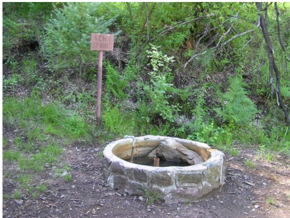
Kent Springs – Santa Rita Mountains

Photo through the courtesy of the Arizona Historical Society