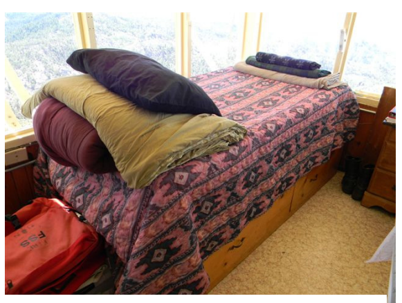
Lookout Sleeping Area