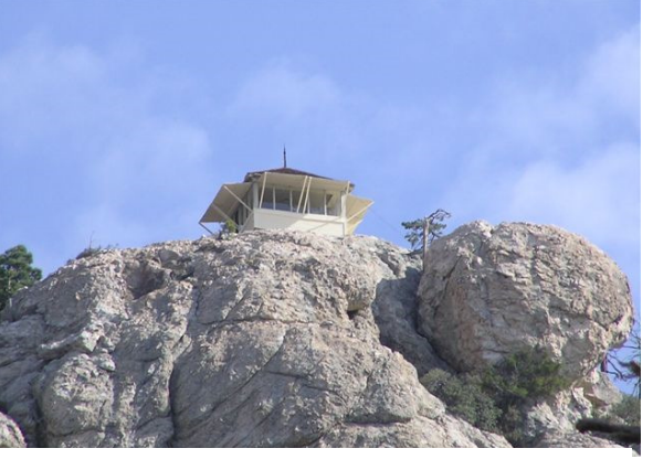
Lemmon Rock Lookout View from Below