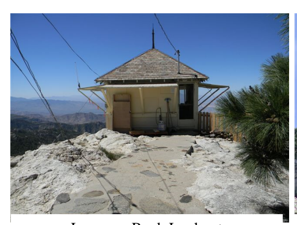
Lemmon Rock Lookout

This lookout tower was replaced in 1928 and the new lookout was located on Lemmon Rock since that location resulted in a much better viewing area. The Lemmon Rock Lookout is a ground mounted, standard L-4 structure. The L-4 is a 14-foot by 14-foot frame pre-cut lookout house. It has a peaked roof and wooden panels that are mounted horizontally over the windows to provide shade. The panels can be lowered when the lookout is not in use. The lookout is a single room and contains a work area, kitchen, sleeping area and a fire finder. The Lemmon Rock Fire Lookout is the only fire lookout in the Catalina Mountains that is still in active use during the high fire danger period.