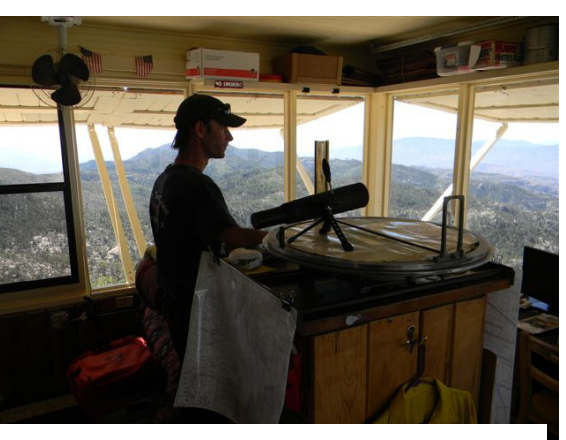
Fire Finder with Ranger on Duty