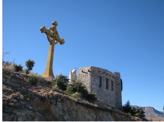
75 Foot Celtic Cross & Chapel