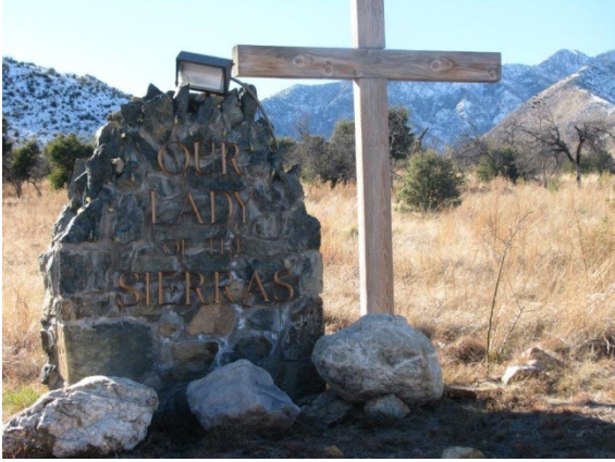
Entrance Sign to the Shrine Property