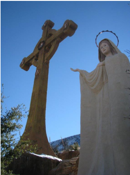
Celtic Cross & Statue of Mary