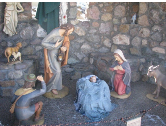
Our Lady of Guadalupe Grotto