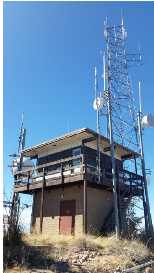
Red Mountain Lookout – January 2020