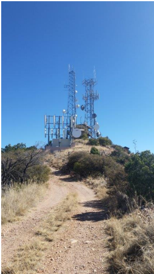
Red Mountain Lookout –January 2020

The lookout site has a multi-purpose function. In addition to the lookout, the site contains extensive communications equipment that includes radio relay service for the Forest Service, Border Patrol and the Santa Cruise County Sheriff.