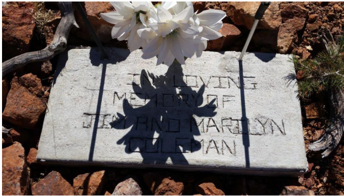
Coleman Memorial Plaque