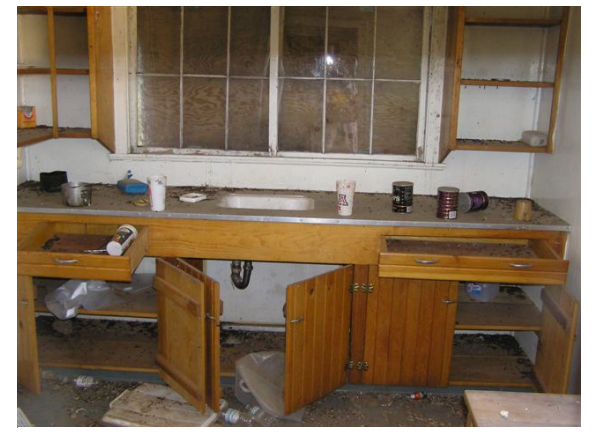
Figure 6. Condition of Kitchen Area