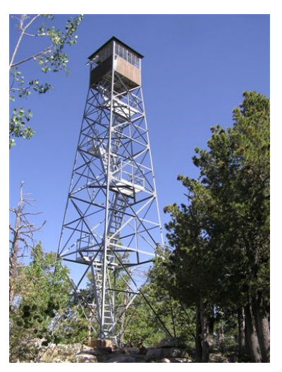
[Figure 1. Webb Peak Fire Lookout in 2014

The Webb Peak Fire Lookout is an inactive U.S. Forest Service Fire Lookout located on Webb Peak in the Pinaleno Mountains of southern Arizona at an elevation of 10.029 feet. It was built in 1933 and consists of a 7-foot by 7-foot metal cab mounted on a 46-foot tall Aermotor CL 100-106 metal tower (See Figure 1). Access to the cab is via five sections of relatively steep ladder separated by four platforms and through a trapdoor in the floor of the cab (See Figure 2). Space within the cab is very limited with virtually standing room only. The only equipment within the cab is a fire-finder (See Figure 3). The condition of the cab has deteriorated since the lookout was deactivated and there are several broken windows. A support cabin (See Figure 4) and latrine (See Figure 5) were constructed a short distance from the lookout for use by the ranger when he was not on duty. The support cabin has not been secured for some time and the interior has