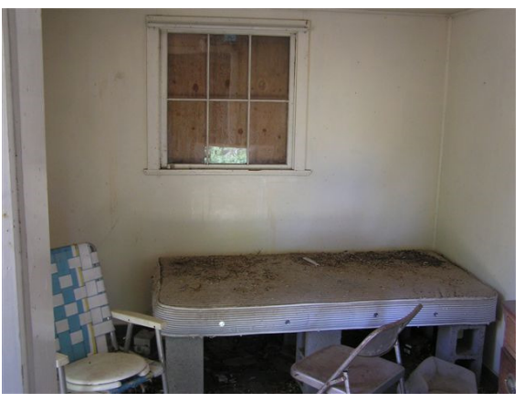
Figure 7. Condition of Sleeping Area

Summary prepared by T. Johnson in June 2014 and updated in 2019 from data contained in the Fire Lookout and Fire Tower web sites. The photo in Figure 2 was taken by Valerie Robinson in 2013. All other pictures were by T. Johnson in 2014