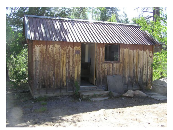
Figure 4. Ranger Support Cabin