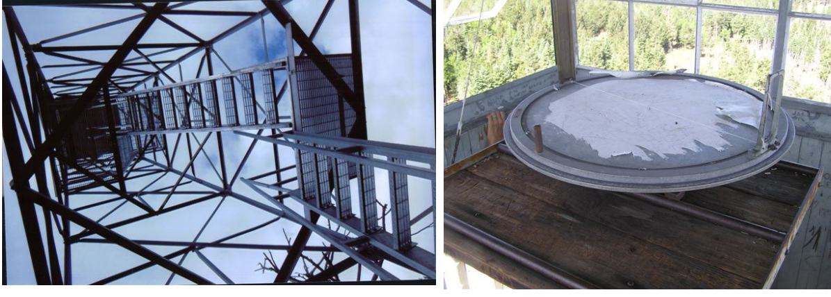
Figure 2. Ladder/Platform Access

The supporting structures for the lookout are no longer in existence. The lightning caused Frye Fire of June 2017 destroyed them. The metal tower and cab were still standing during a visit to the area after the fire but no attempt was made to determine if the cab was still accessible. The fire finder had been removed prior to the fire. That makes three fire lookouts that were visited during hiking club hikes that have been destroyed or severely damaged since 2011: the Atascosa Fire Lookout in the Atascosa Mountains during the Murphy Complex Fire of June 2011, the Barfoot Fire Lookout in the Chiricahua Mountains during the Horseshoe II Fire of June 2011 and then the Webb Peak Lookout in 2017.